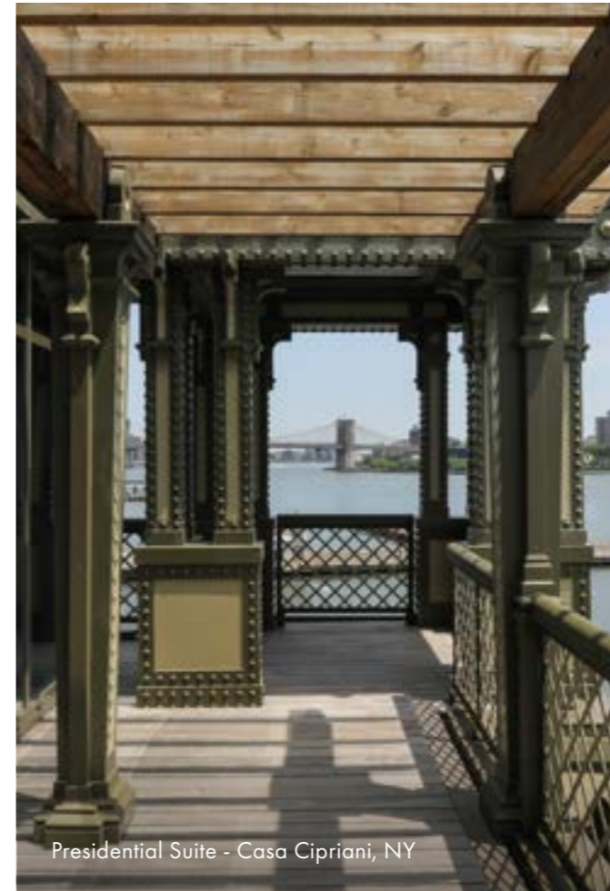
Presidential Suite - Casa Cipriani, NY