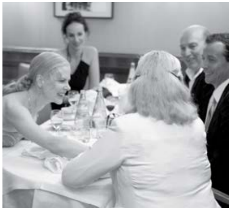
Nicole Kidman at Cipriani Restaurant