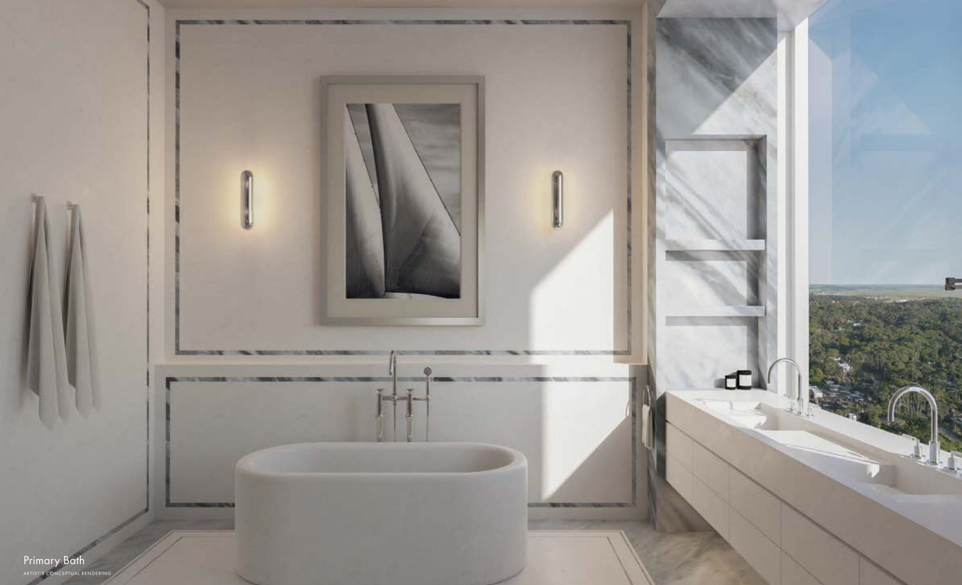
Primary Bath ARTIST'S CONCEPTUAL RENDERING

Interior Finishes Option 1 TRADIZIONALE CIPRIANI