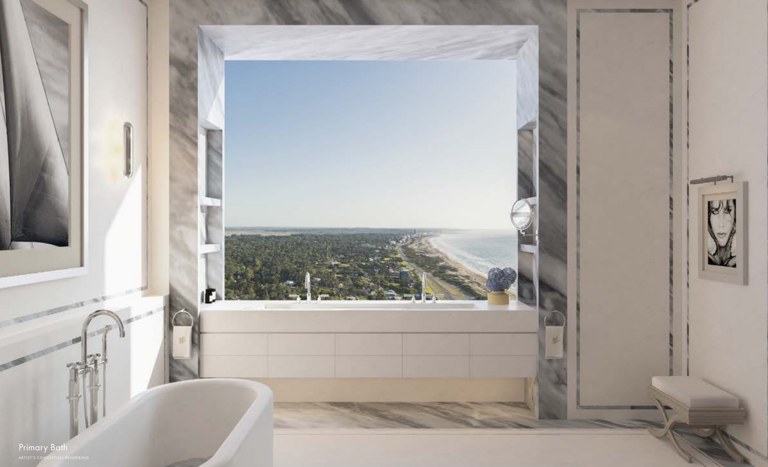
Primary Bath ARTIST'S CONCEPTUAL RENDERING

Interior Finishes Option 1 TRADIZIONALE CIPRIANI