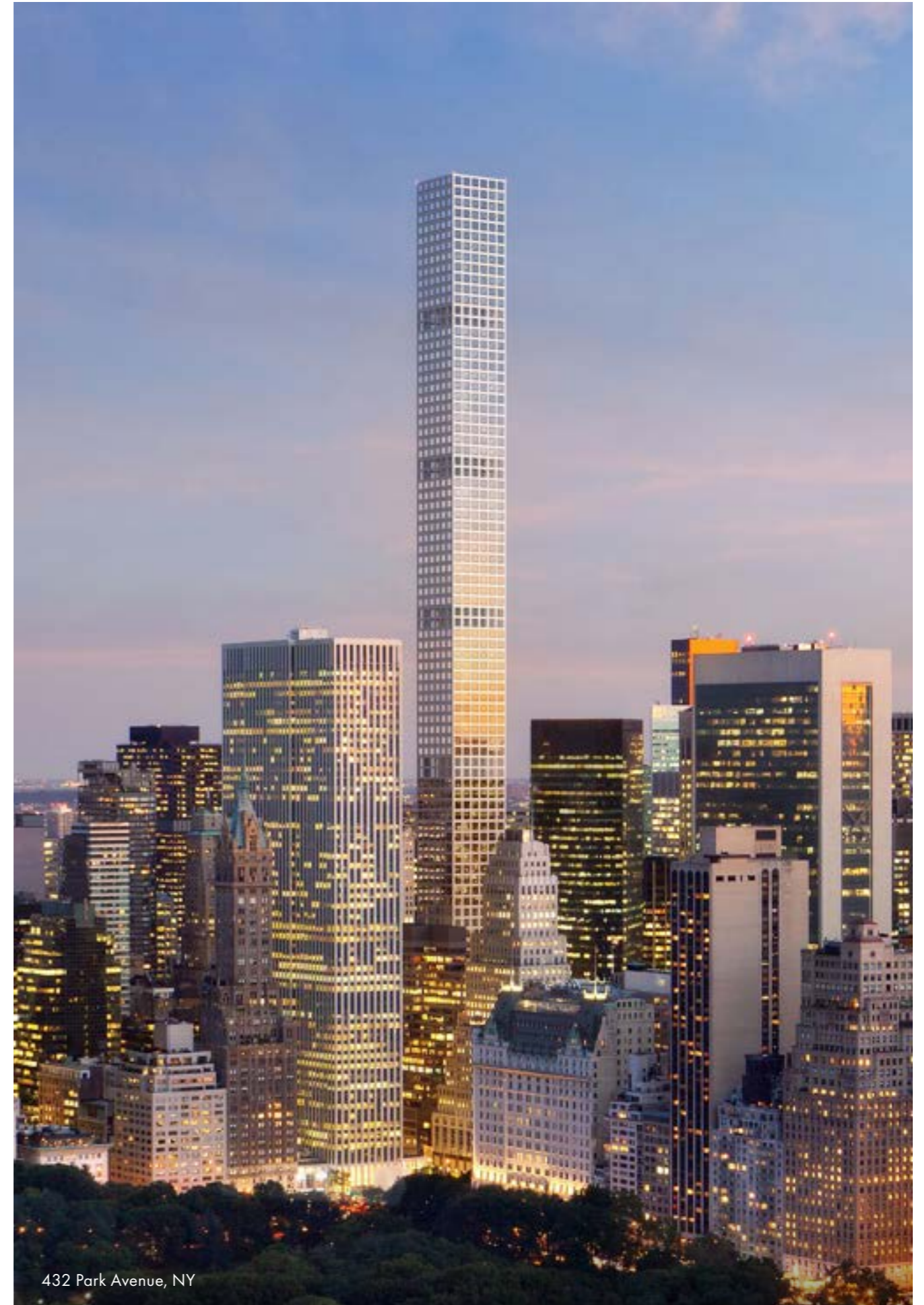
432 Park Avenue, NY