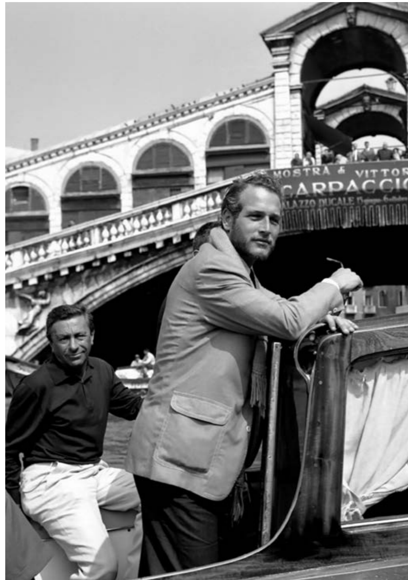
Paul Newman by the Rialto Bridge in Venice