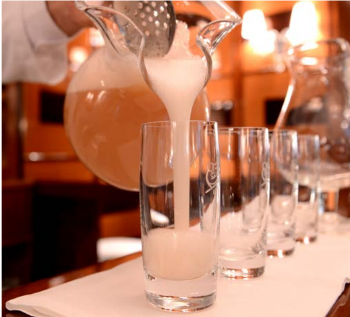
The Bellini was invented in 1948 at Harry's Bar in Venice.