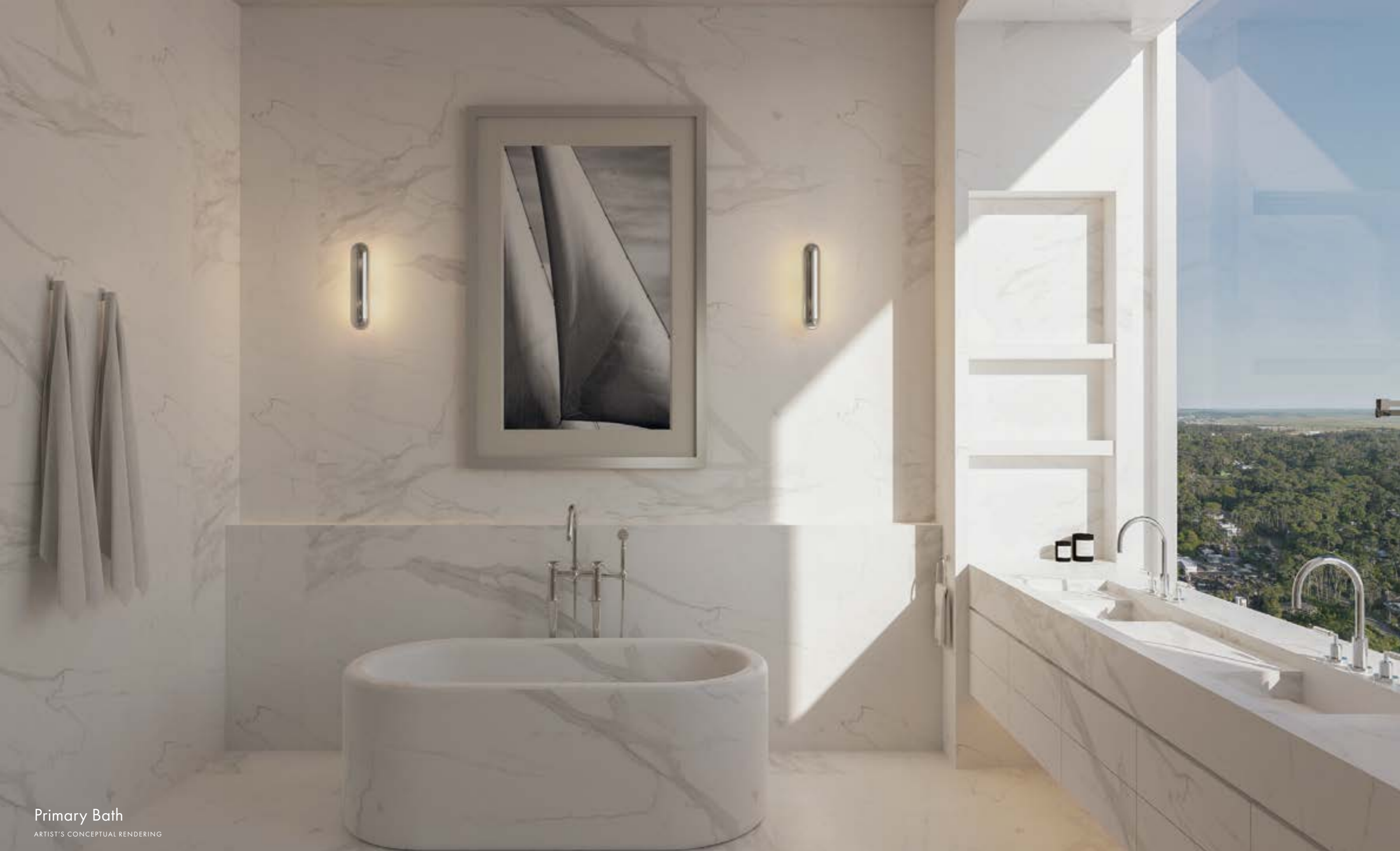
Primary Bath ARTIST'S CONCEPTUAL RENDERING