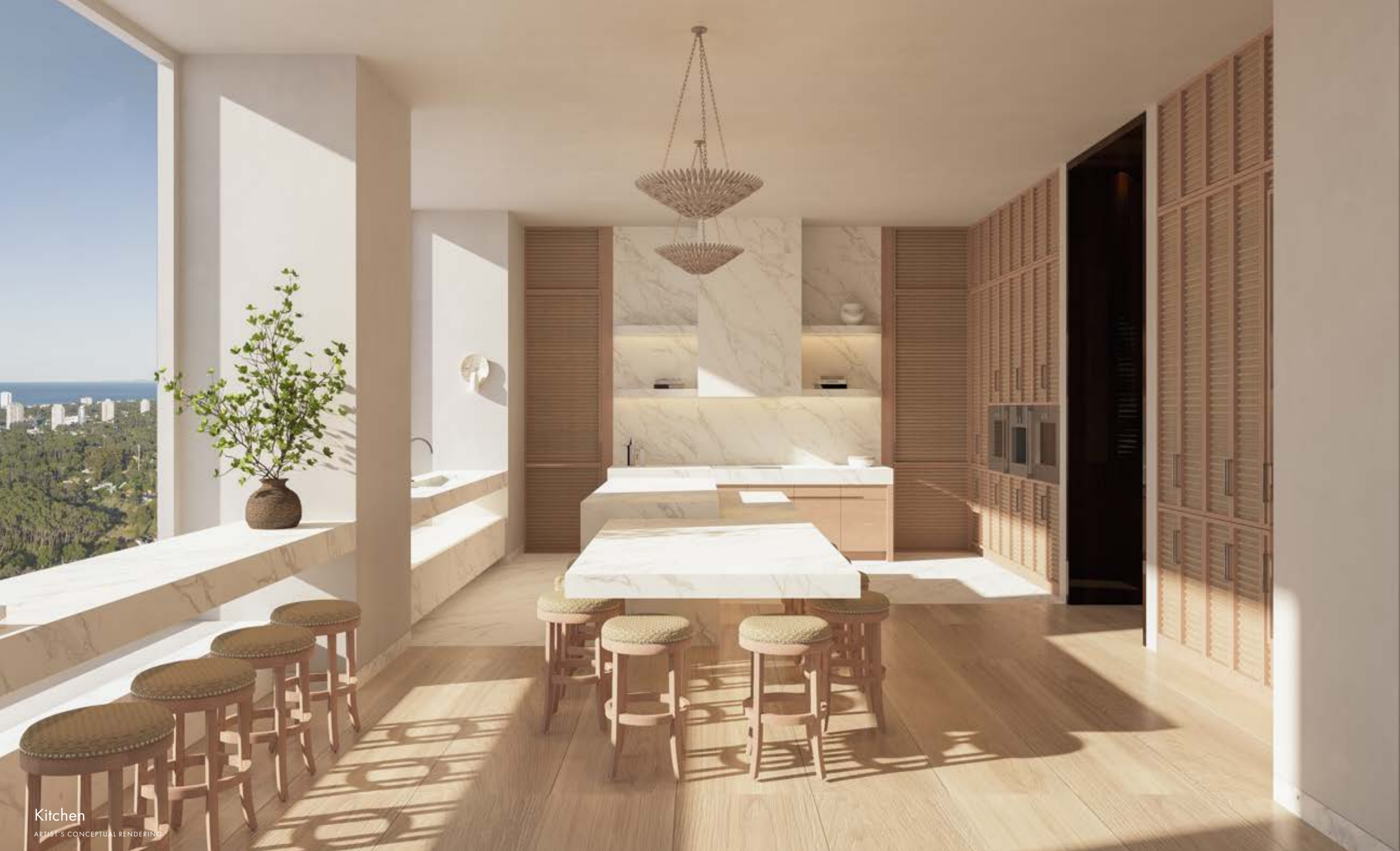
Kitchen ARTIST'S CONCEPTUAL RENDERING