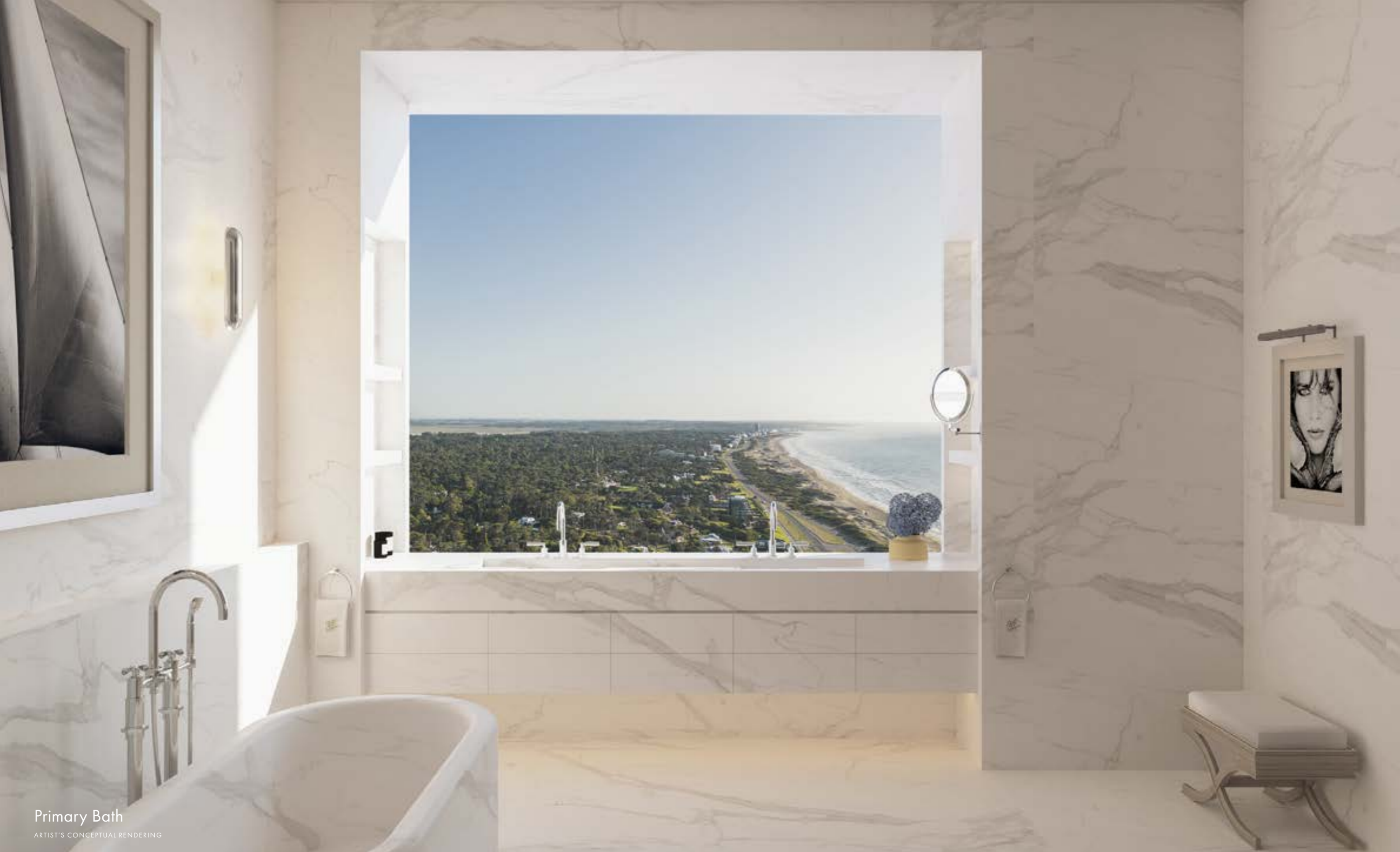
Primary Bath ARTIST'S CONCEPTUAL RENDERING

Interior Finishes Option 2 MODERNO CONTEMPORANEO