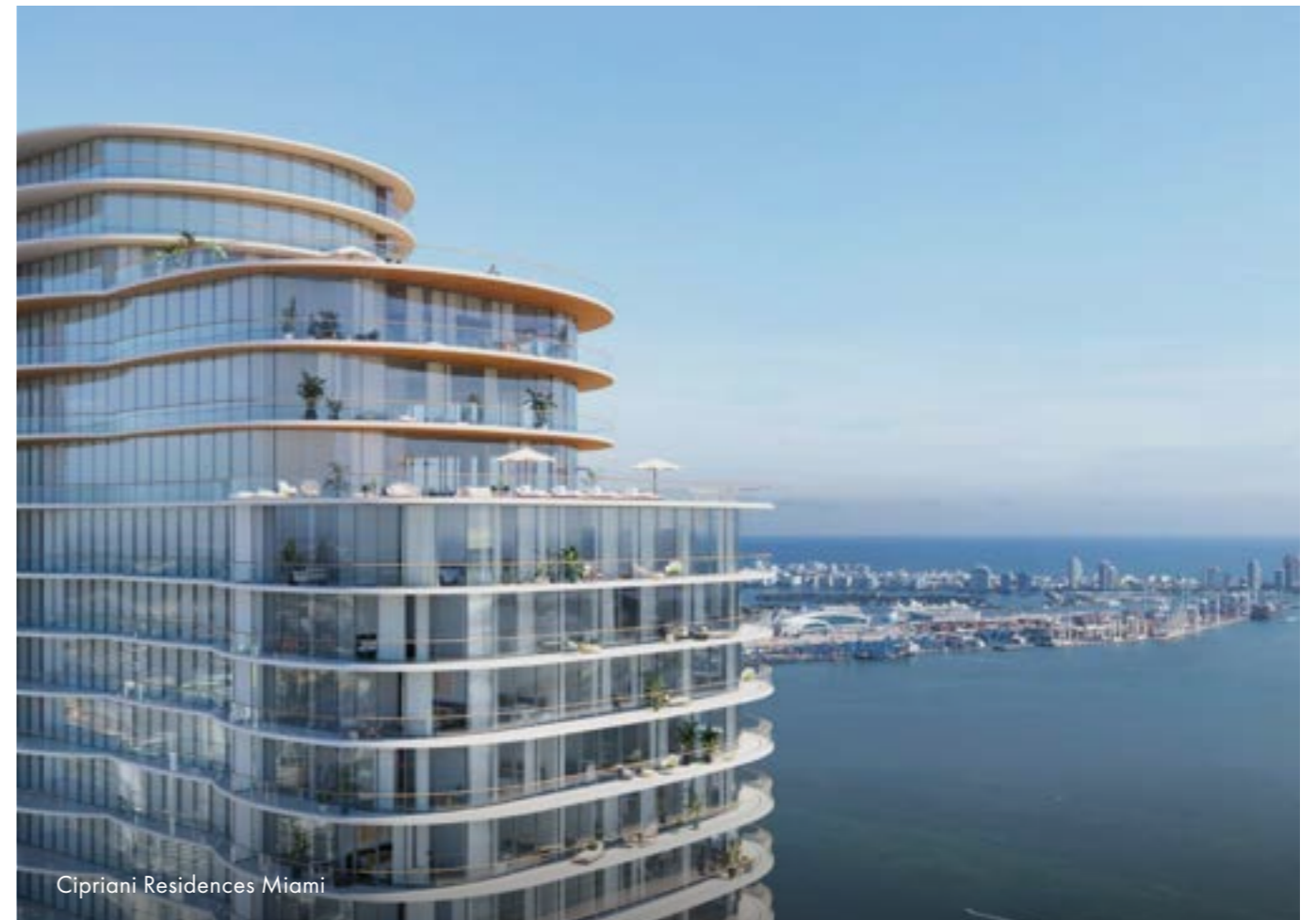
Cipriani Residences Miami