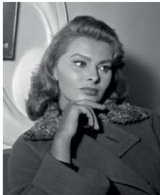
Sophia Loren at Cipriani Hotel