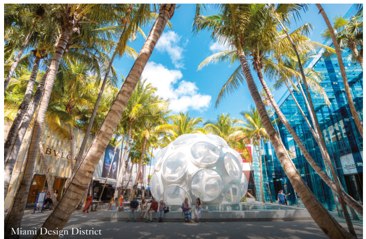
Miami Design District