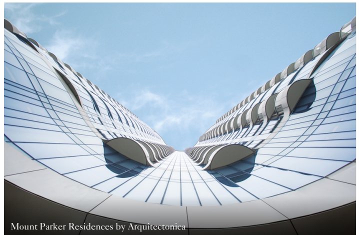
Mount Parker Residences by Arquitectonica