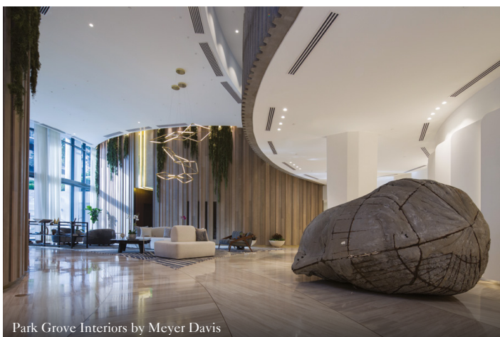
Park Grove Interiors by Meyer Davis