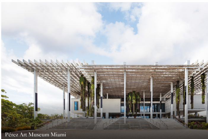
Pérez Art Museum Miami