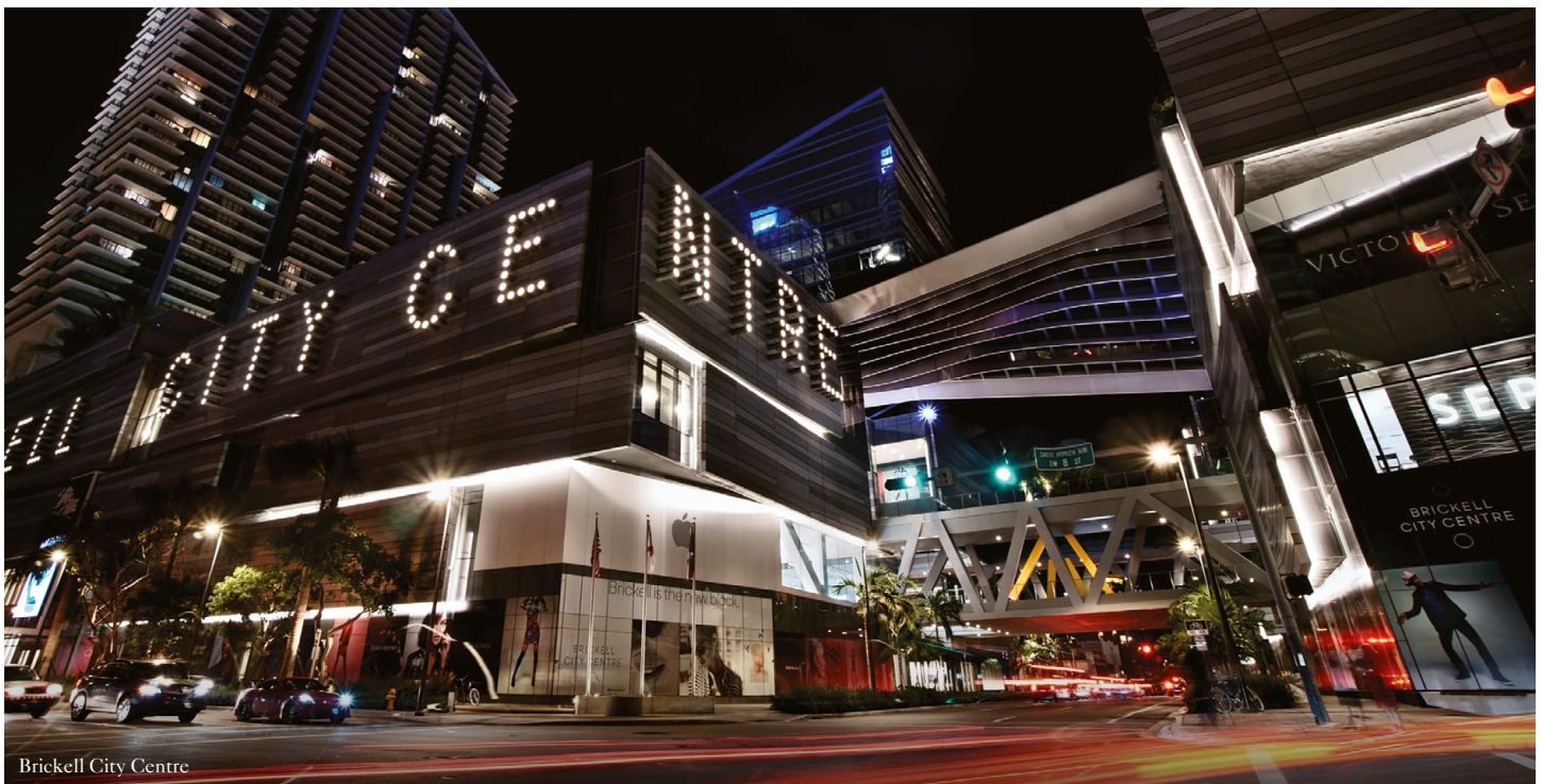
Brickell City Centre

Perfectly positioned at the entrance of Brickell Avenue, where the Miami River meets the beautiful blue waters of Biscayne Bay, and the bustling financial district blends with high-end shopping, top restaurants, cultural hot spots and exiting nightlife – this iconic neighborhood is an all-day all-night lifestyle destination, aptly named the Manhattan of the South.