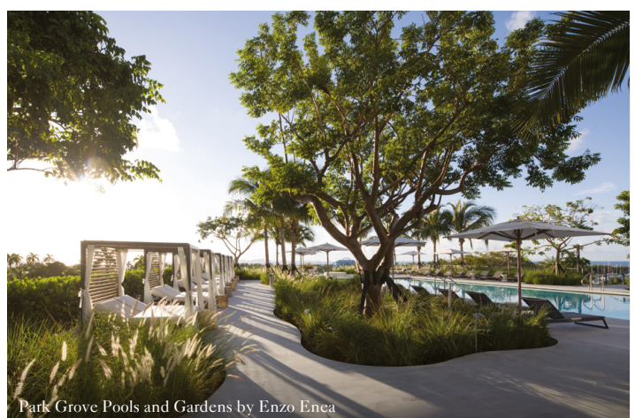
Park Grove Pools and Gardens by Enzo Enea