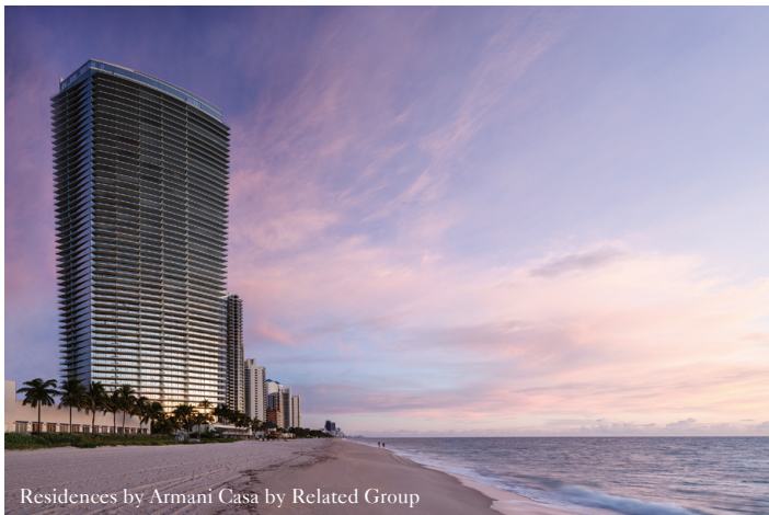
Residences by Armani Casa by Related Group

Renowned Swiss landscape architect Enzo Enea of Zurich-based Enea Garden, is one of the leading landscape architects in the world. A hallmark of Enzo Enea's work is the fusion of indoor and outdoor spaces, the creative intertwining of the soul of the residence with its surroundings.