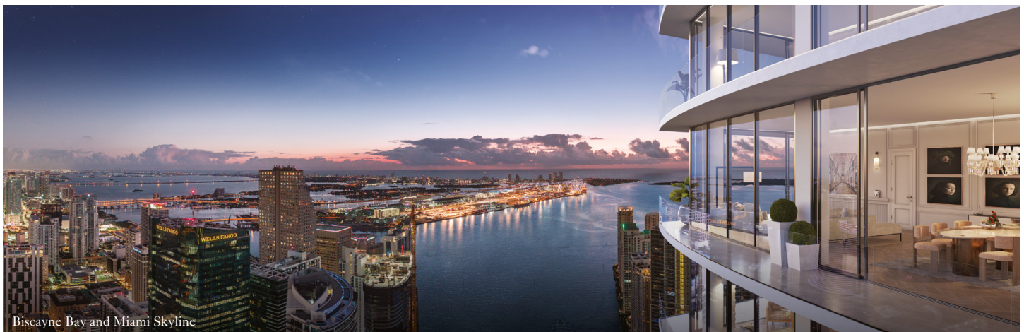
Biscayne Bay and Miami Skyline