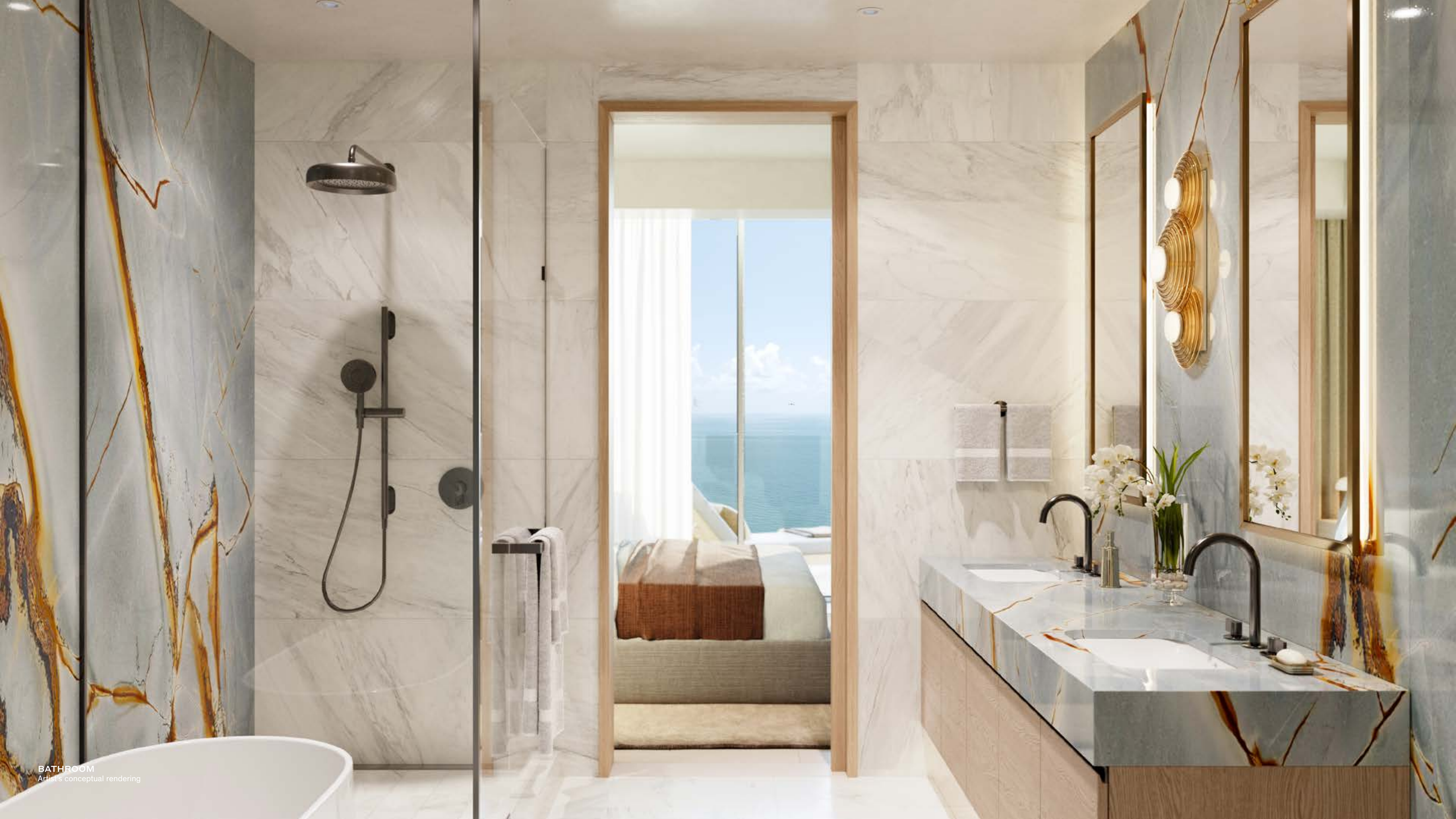
BATHROOM Artist's conceptual rendering