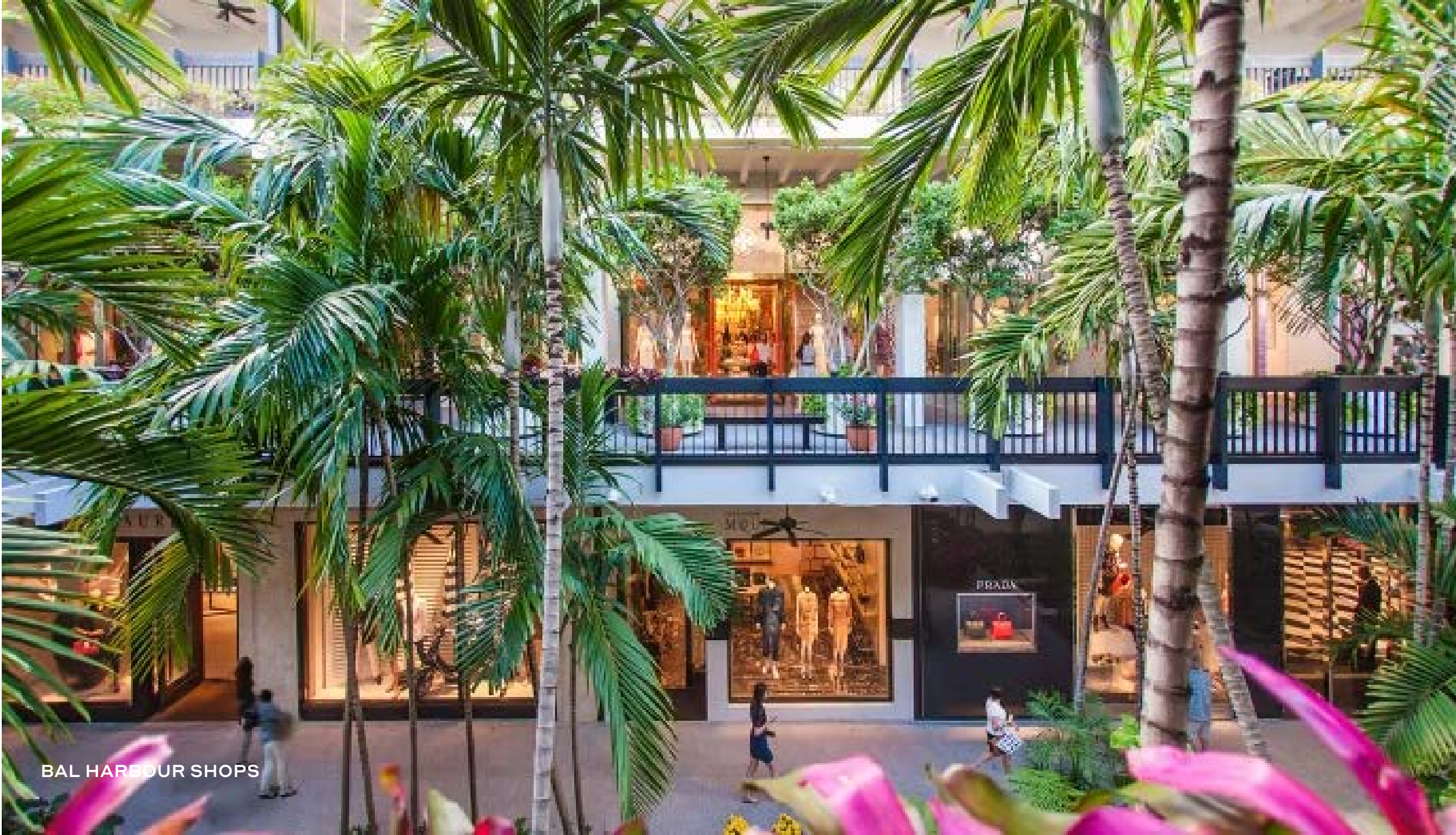
BAL HARBOUR SHOPS

One-of-a-kind waterpark and outdoor experience, located at the JW Marriott Turnberry Resort & Spa.