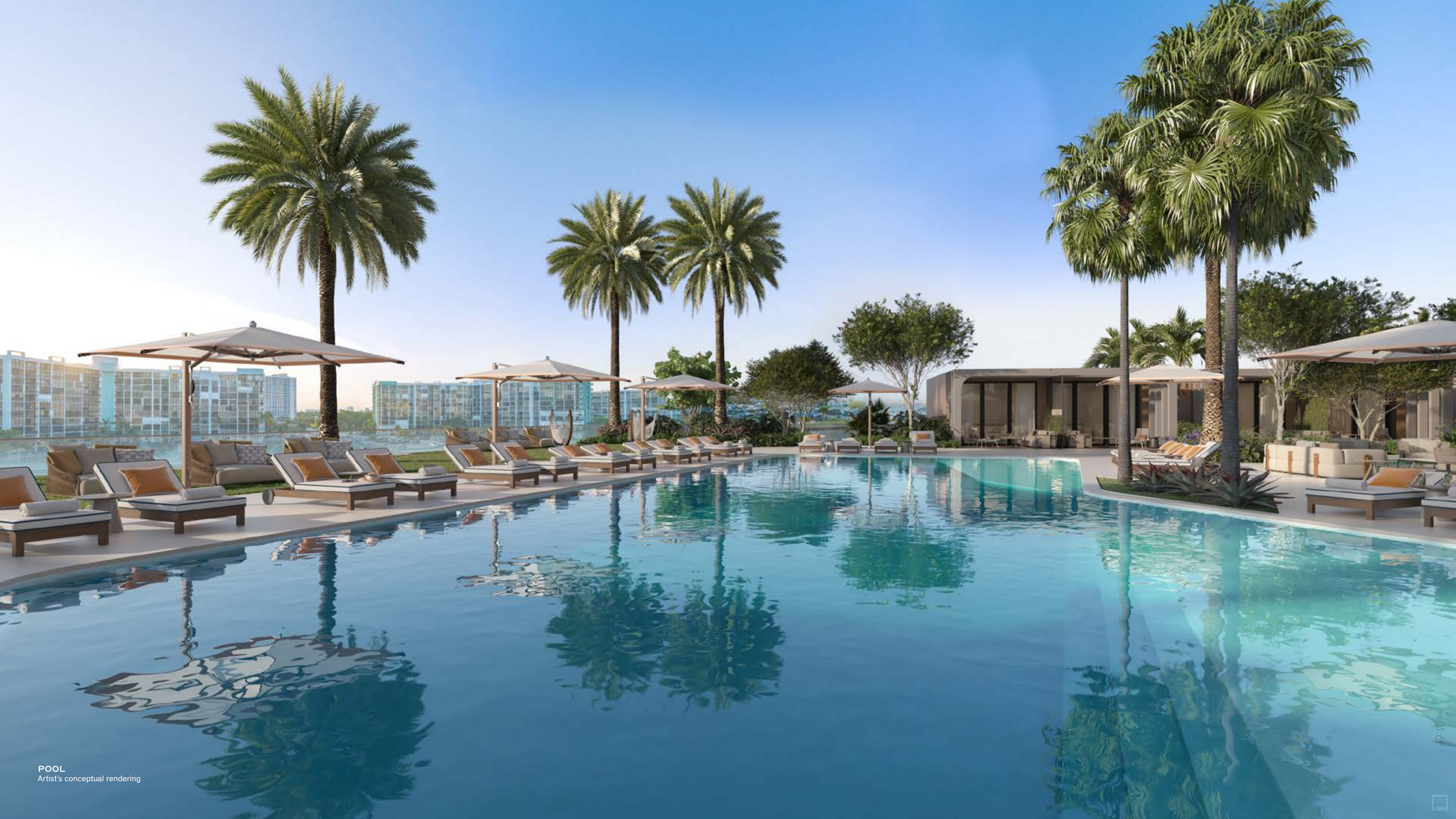
POOL Artist's conceptual rendering