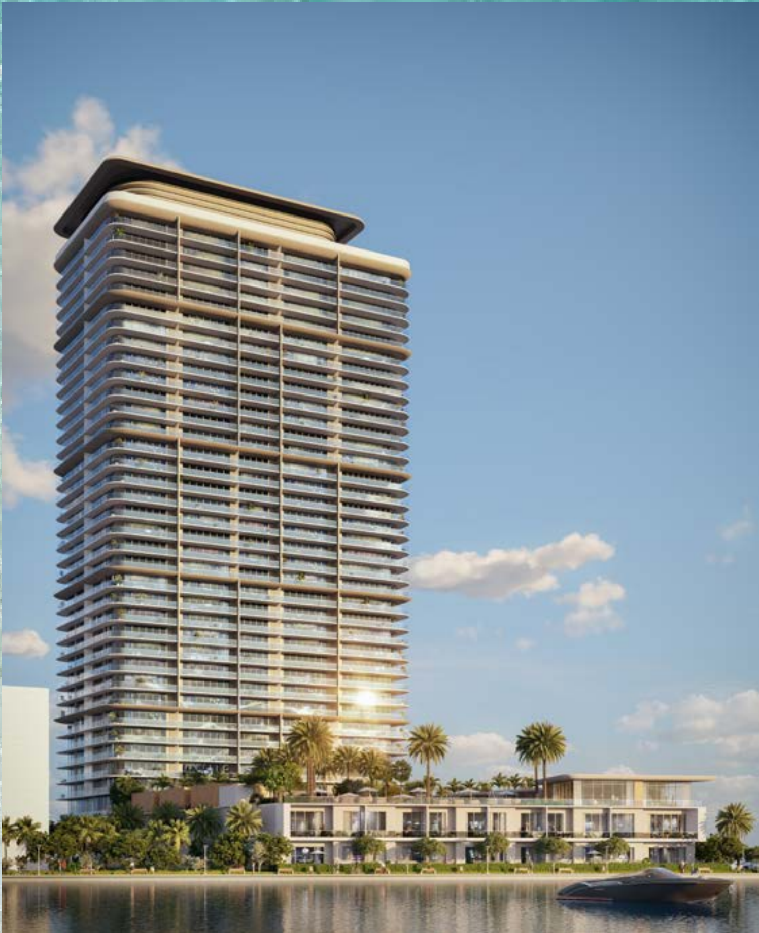
EXTERIOR Artist's conceptual rendering