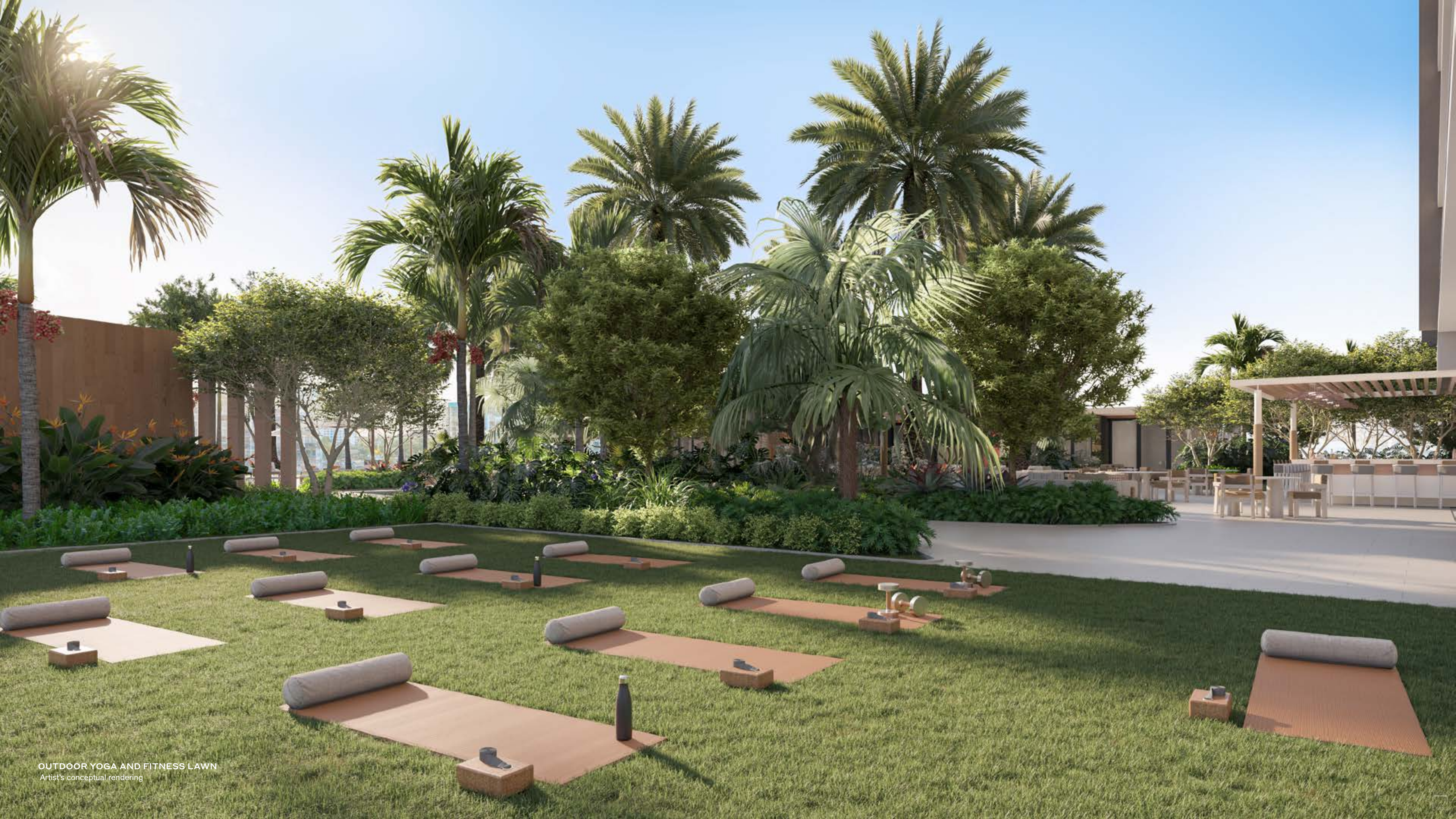
OUTDOOR YOGA AND FITNESS LAWN Artist's conceptual rendering