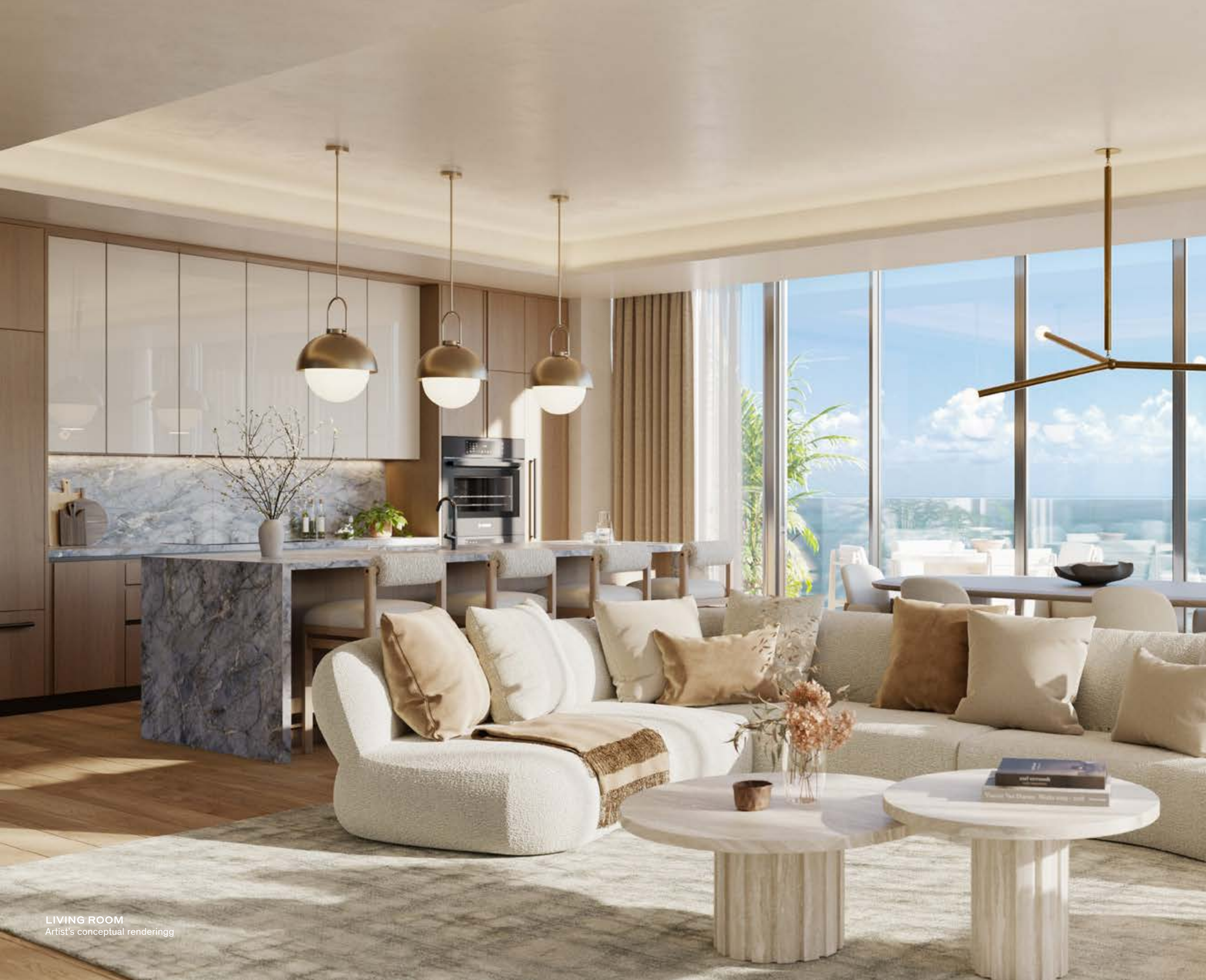
LIVING ROOM Artist's conceptual renderingg