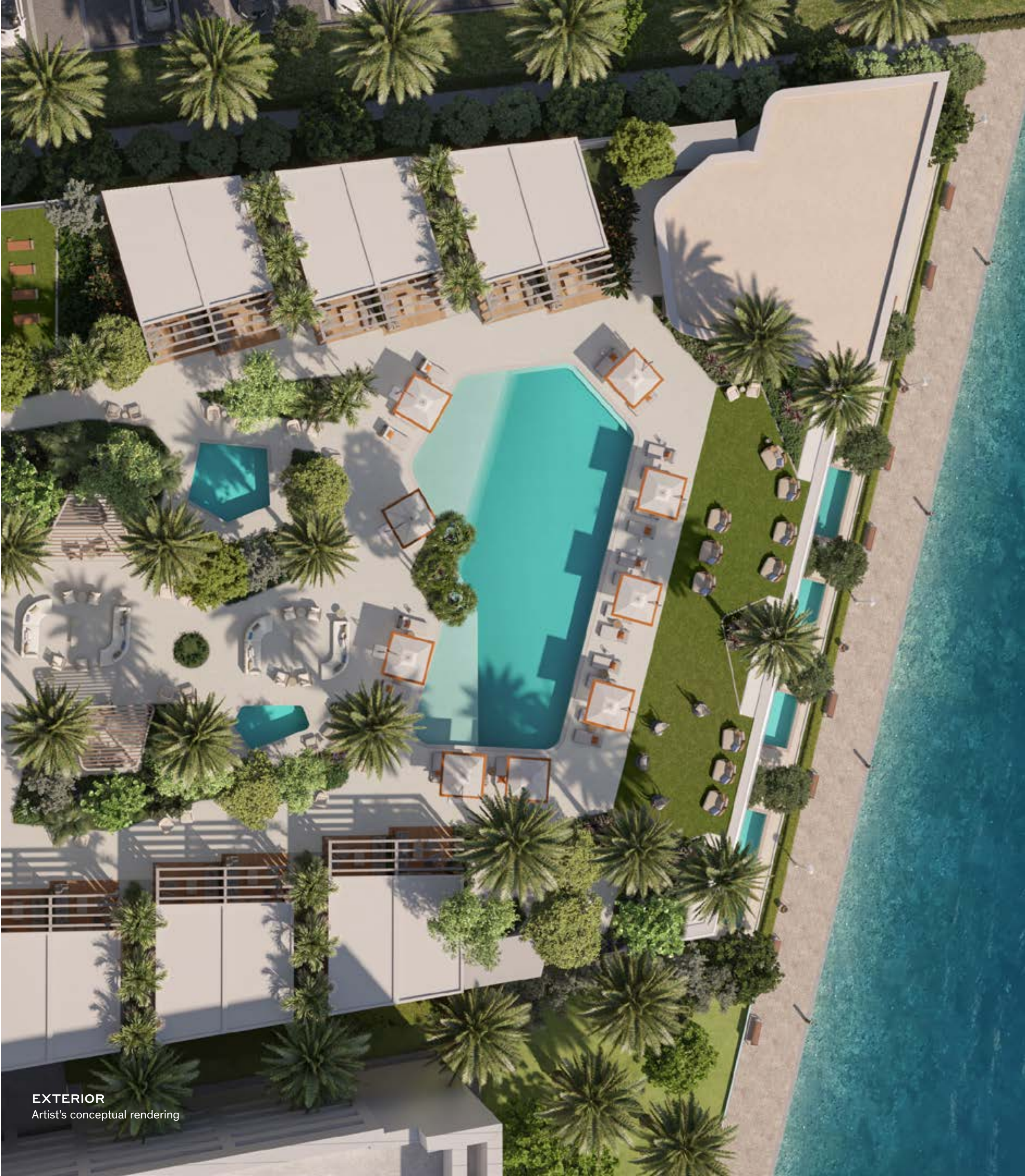
EXTERIOR Artist's conceptual rendering