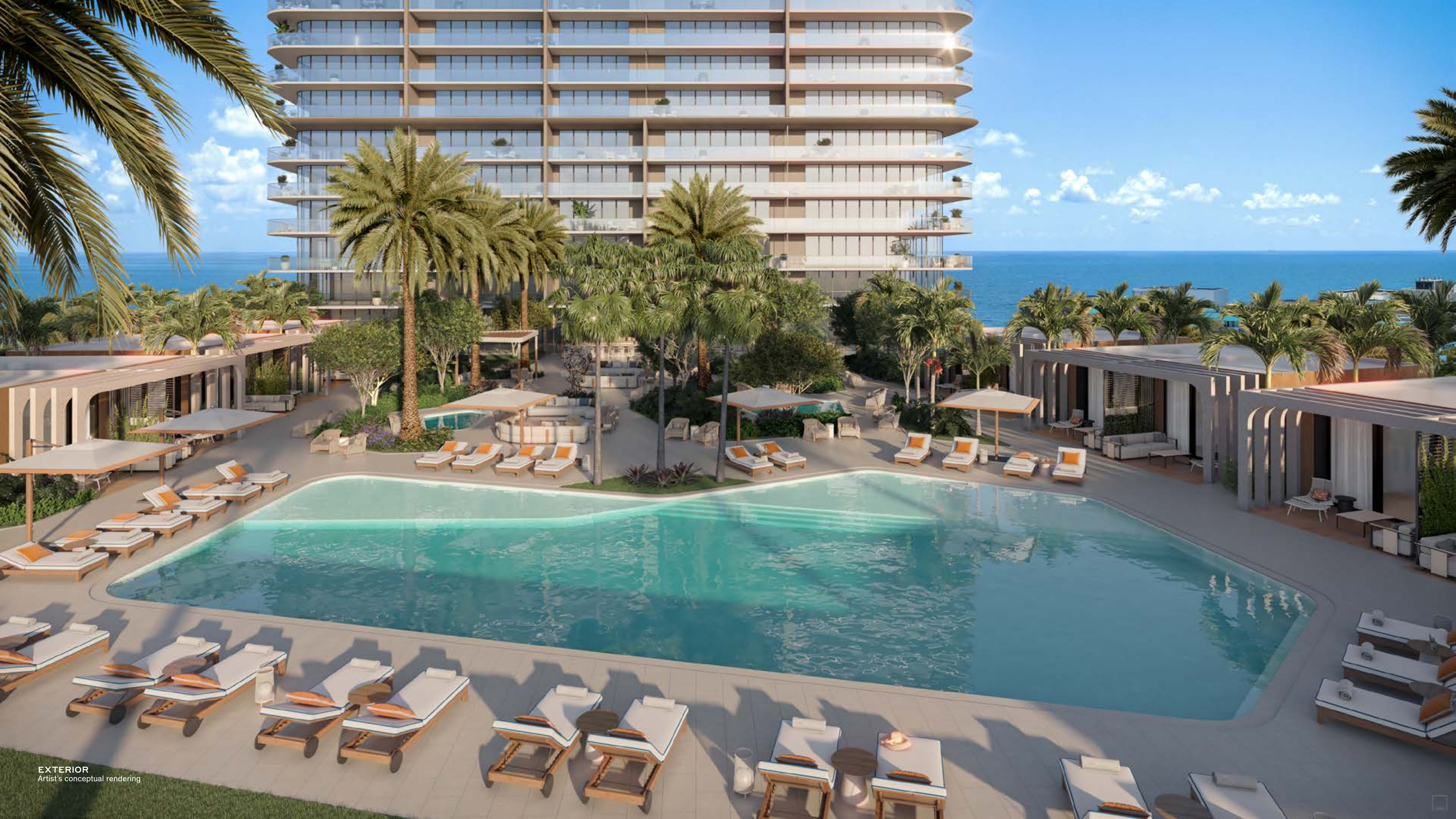
EXTERIOR Artist's conceptual rendering