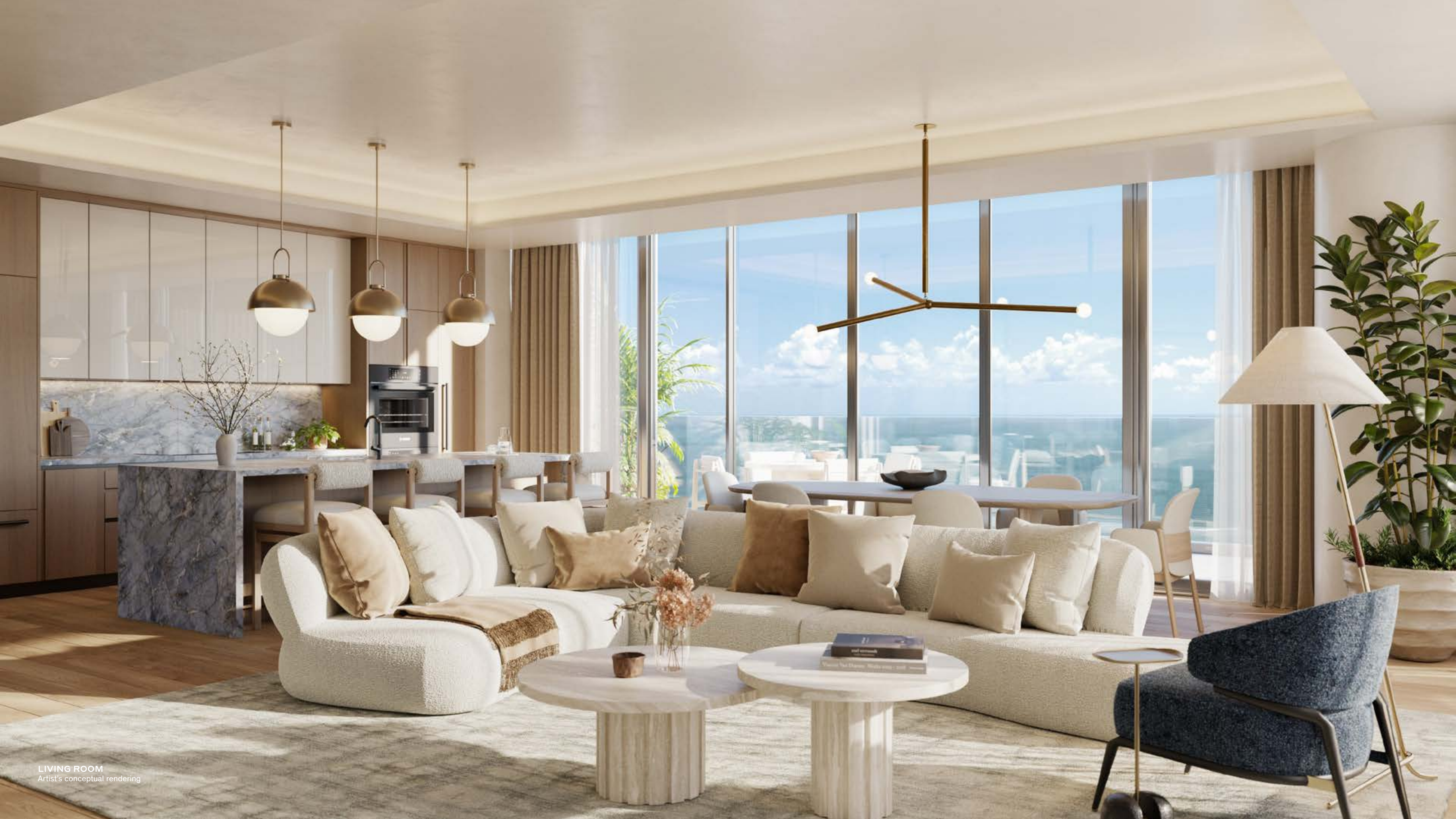
LIVING ROOM Artist's conceptual rendering