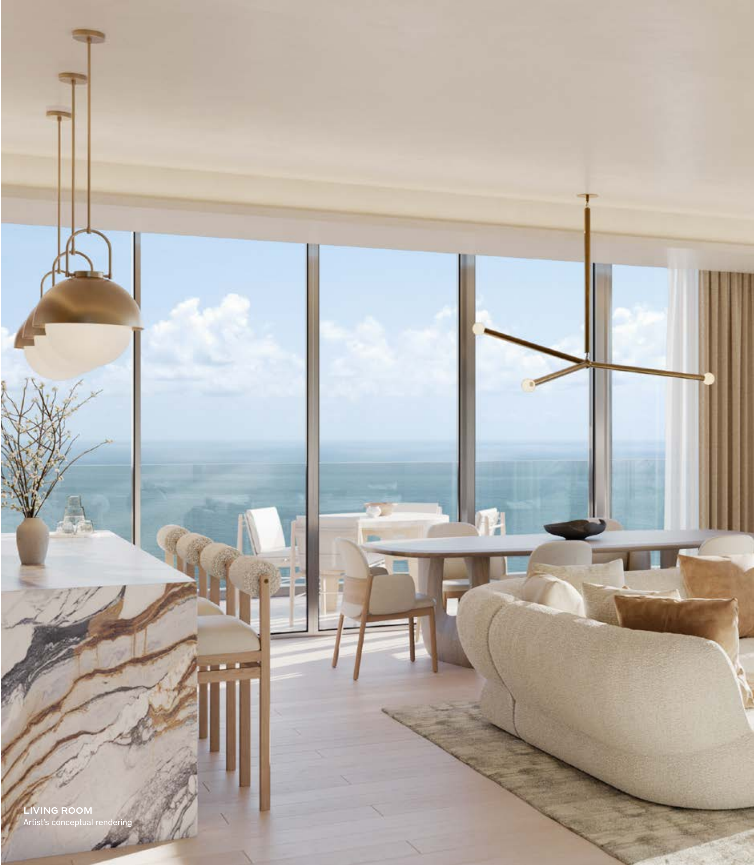
LIVING ROOM Artist's conceptual rendering

Interiors by Meyer Davis are graced with incredible water views and defined by discreet luxury, iconic design, clean, fluent lines, and striking textures—lending a carefree, refined sensibility to each and every space.