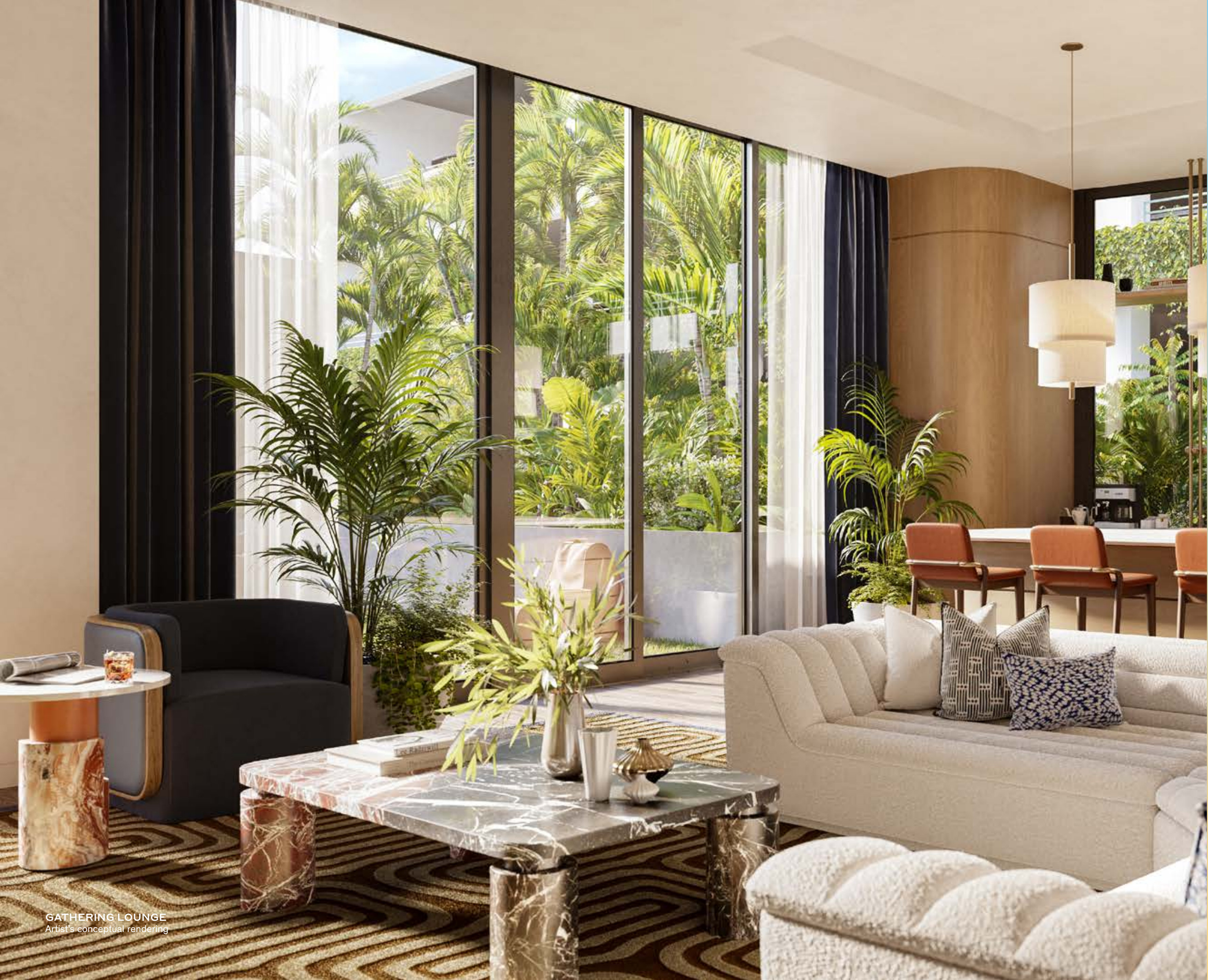
GATHERING LOUNGE Artist's conceptual rendering