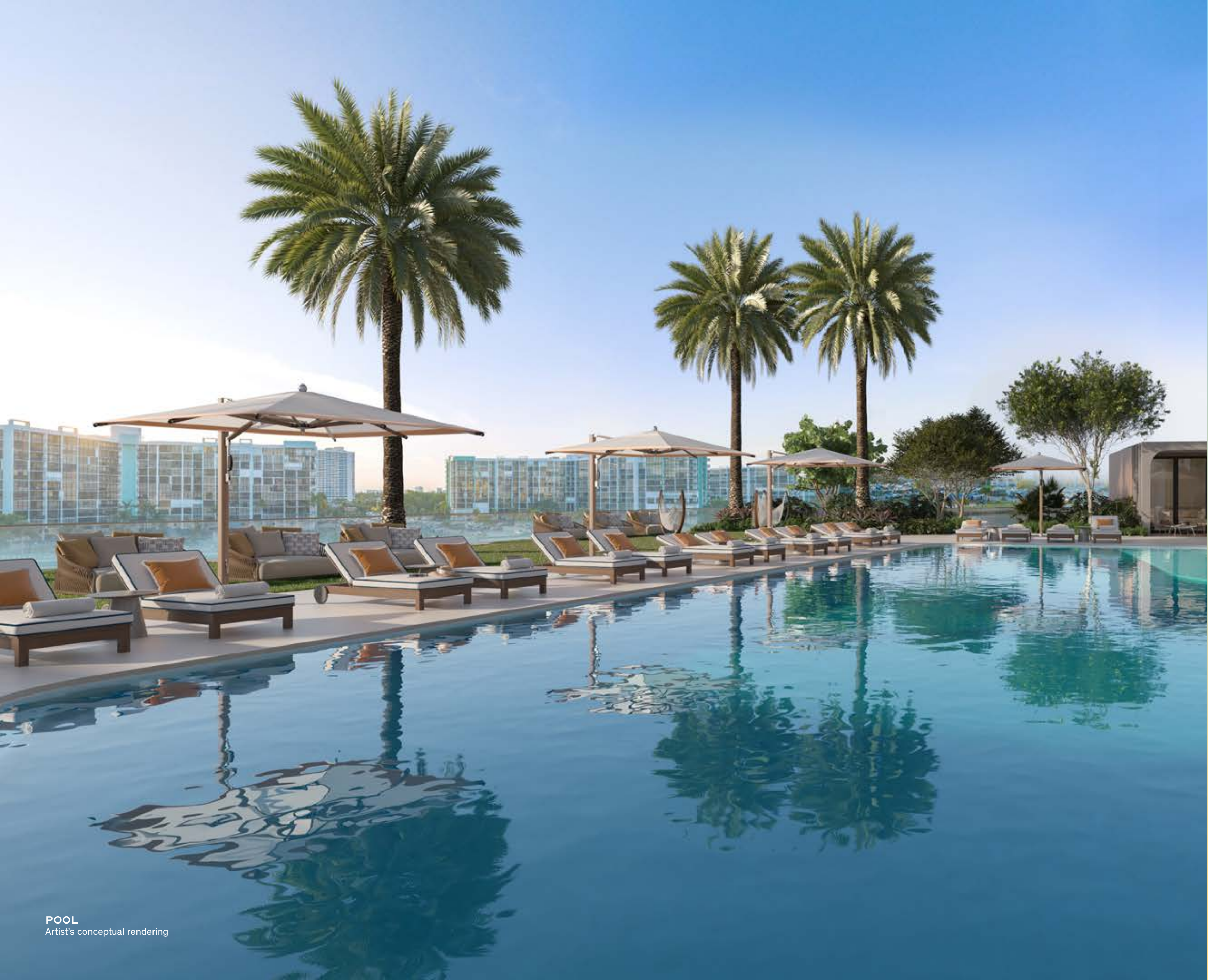
POOL Artist's conceptual rendering