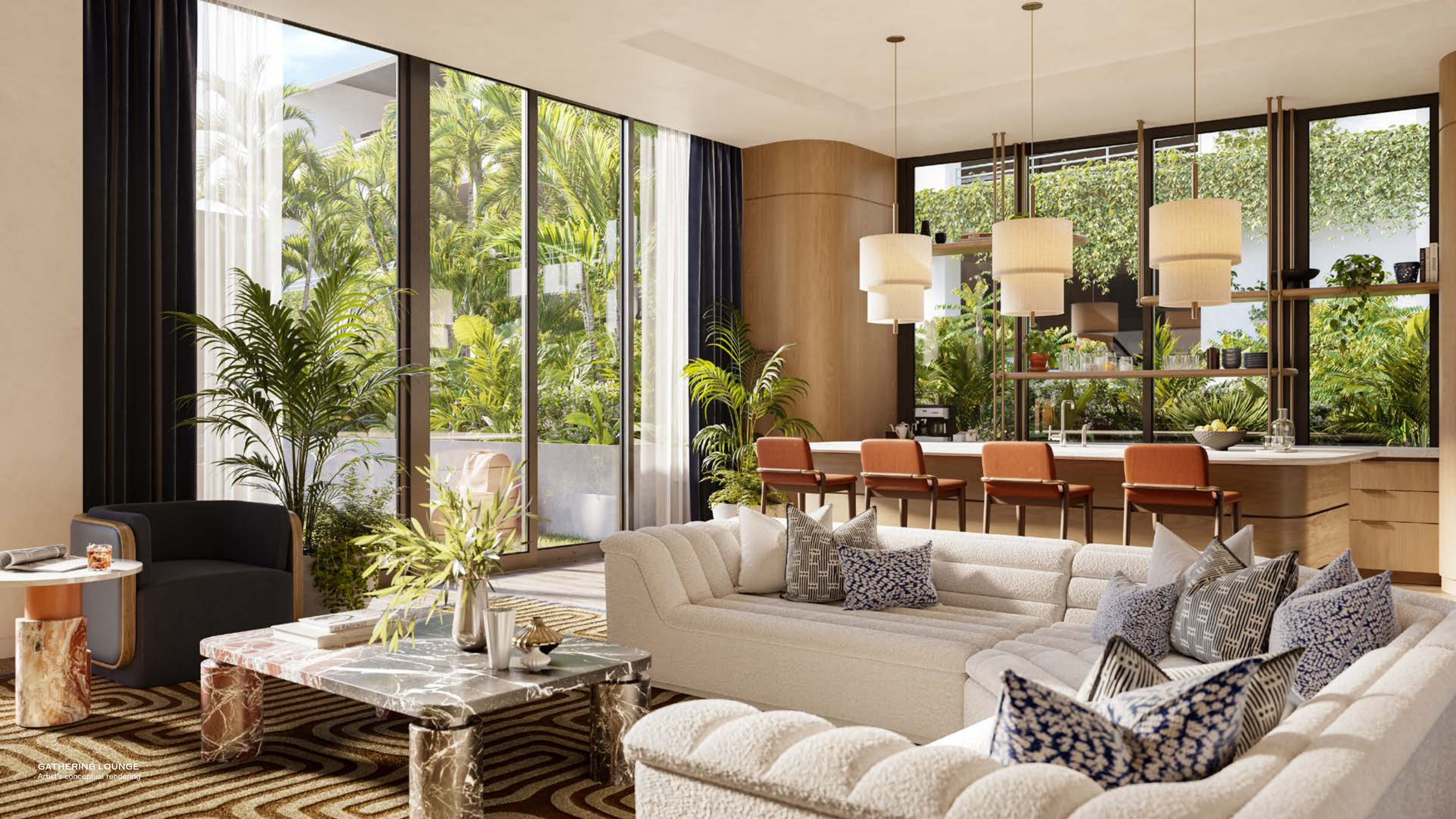
GATHERING LOUNGE Artist's conceptual rendering