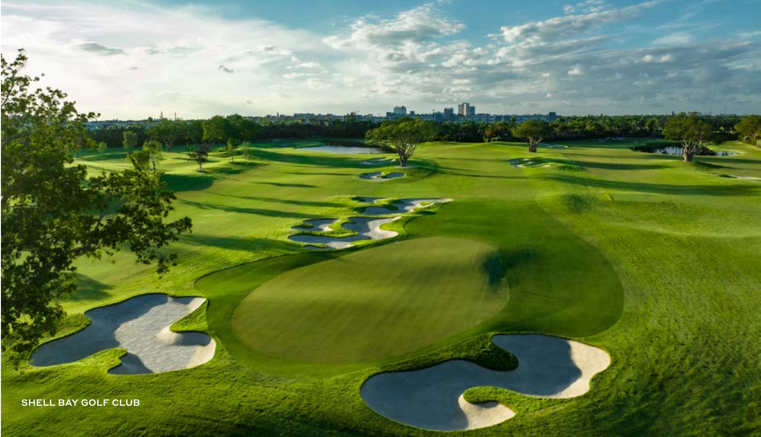
SHELL BAY GOLF CLUB