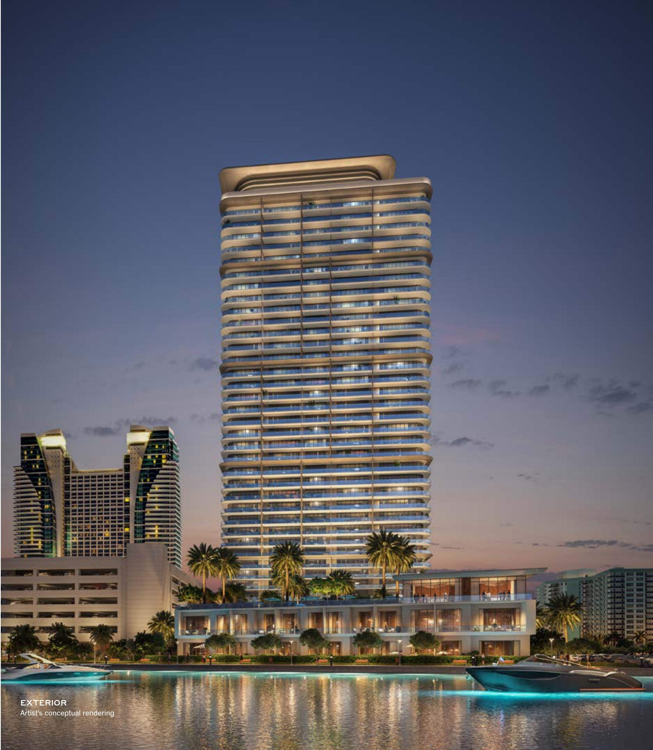
EXTERIOR Artist's conceptual rendering