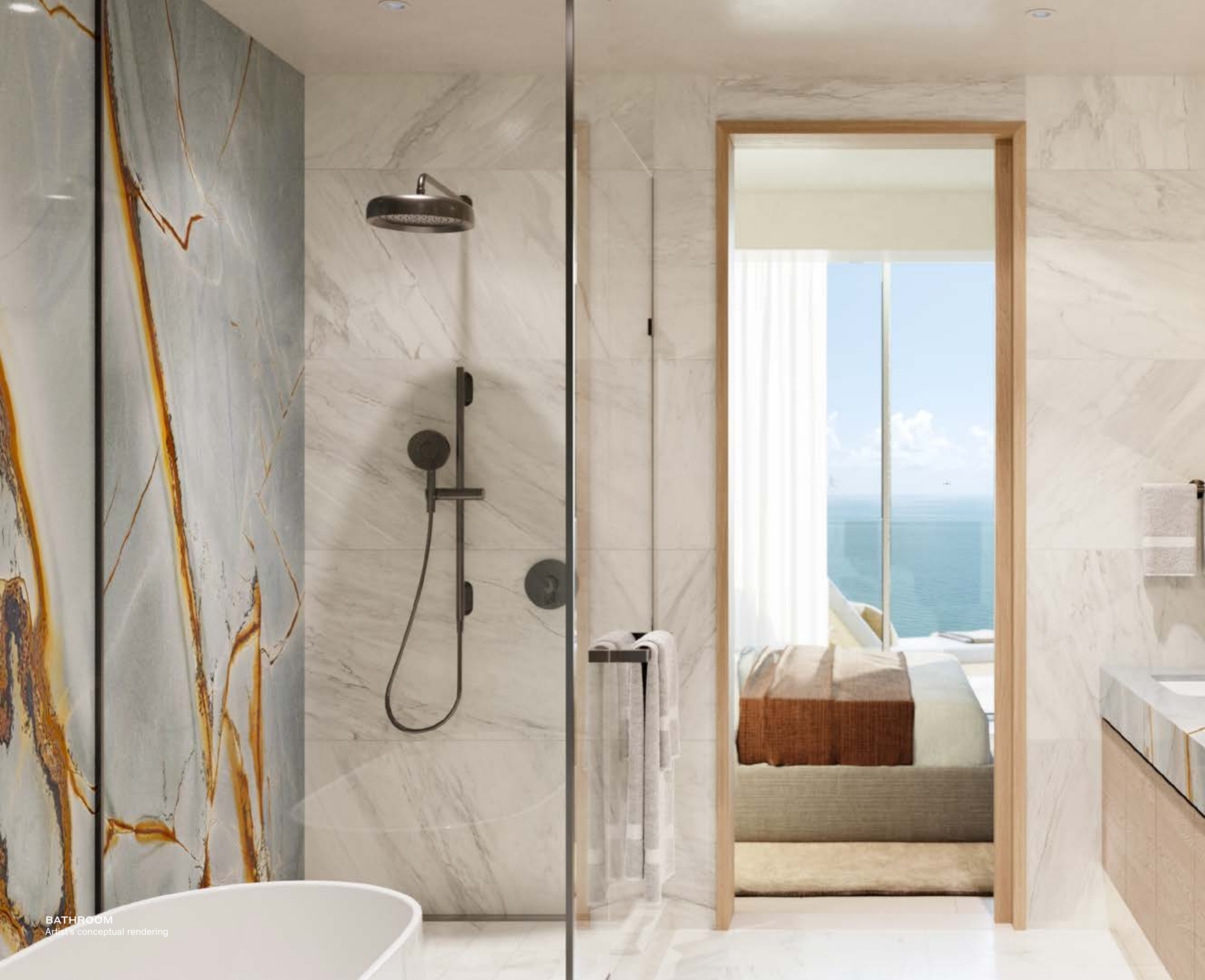
BATHROOM Artist's conceptual rendering