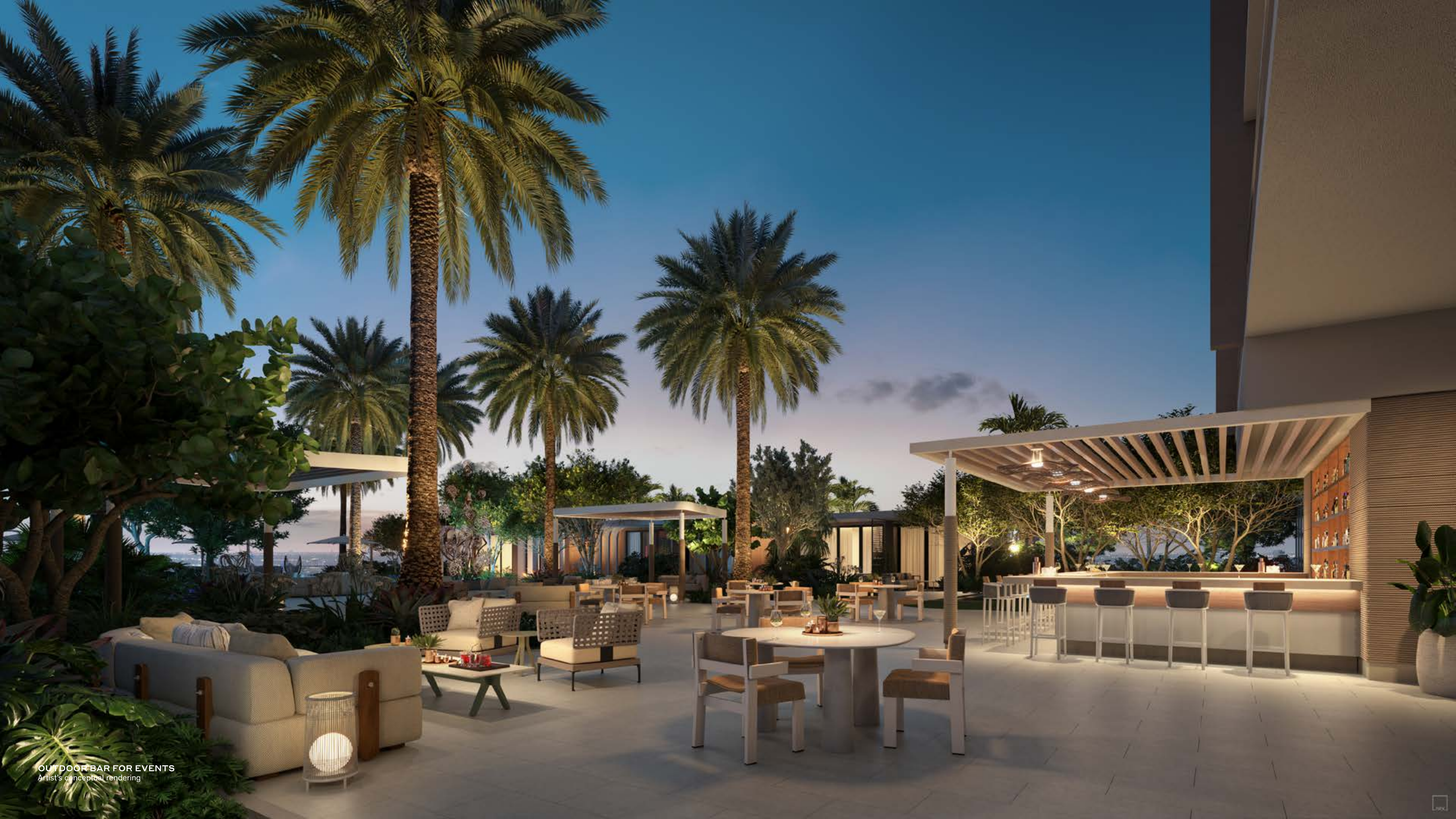
OUTDOOR BAR FOR EVENTS Artist's conceptual rendering